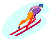
2. ski jumping