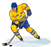
3. ice hockey