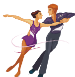
4. figure skating